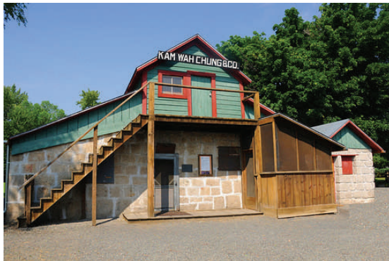
Kam Wah Chung Chinese Museum

If space allows, we'll take non-ENCORE members. Non-members pay the same for their rooms, but pay $64 for transportation.