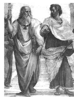
Plato and Aristotle

Location - Astoria Senior Center, 1111 Exchange Street, Astoria